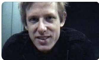
Britt Daniel of Spoon

Today, with dozens of interviews online, Cooking with Rockstars is going strong, providing indie musicians an outlet for music promotion and fans a way to get to know their favorite artists' more personal sides.