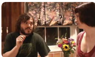
In the kitchen with Jack Black