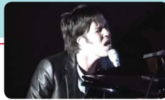
Rufus Wainwright performing