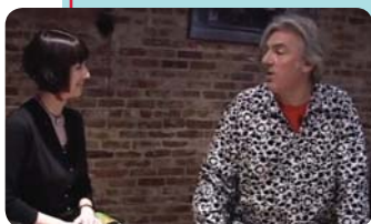
Chatting with Robyn Hitchcock